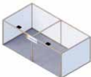
Ecostand 32 Mq (8x4 meters) STANDARD 4.500,00€

Structure 4x4x3 (or 2.50) m consisting of: natural wood walls, grey melange carpet with protective film, company name signage, 1 table, 2 chairs, 1 waste bin, 1 coat hanger, 1 spotlight, 1 multi-socket power strip, 1 desk (100x100x50 cm), 1 black stool, 1 storage room (1x1 m), 3x3 m graphic (canvas sheet or 300 g cardboard).