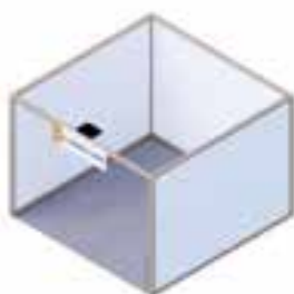
Ecostand 16 Mq (4x4 meters) STANDARD 2.500,00€

Structure 4x4x3 (or 2.50) m consisting of: Natural wood walls, grey melange carpet with protective film, company name signage, 1 table, 2 chairs, 1 waste bin, 1 coat hanger, 1 spotlight, 1 multi-socket power strip.