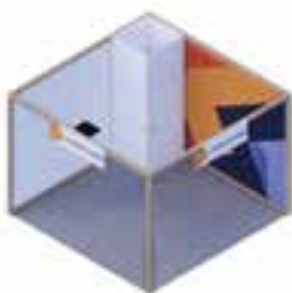
Ecostand 16 Mq (4x4 meters) PRESTIGE 3.100,00€

Structure 4x4x3 (or 2.50) m consisting of: Natural wood walls, grey melange carpet with protective film, company name signage, 1 table, 2 chairs, 1 waste bin, 1 coat hanger, 1 spotlight, 1 multi-socket power strip.